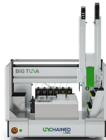
Figure 1: Big Tuna automates buffer exchange for up to 96 unique samples with Unfilter 96 or up to 24 unique samples with Unfilter 24.

Big Tuna was developed to automate the buffer exchange process, enable increased throughput, and provide degrees of process control that are otherwise inaccessible by manual methods (Figure 1). Big Tuna uses a pressure-based ultrafiltration/diafiltration (UF/DF) method to remove buffer.